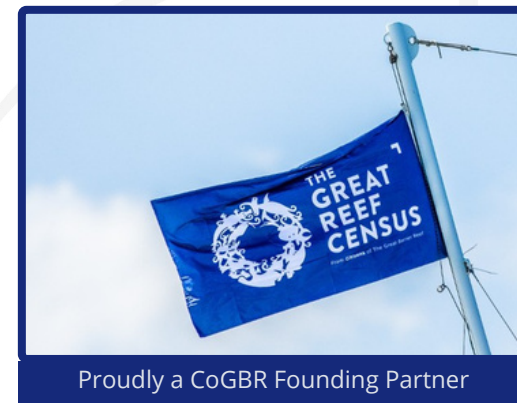
Proudly a CoGBR Founding Partner