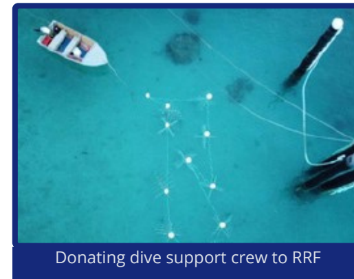
Donating dive support crew to RRF