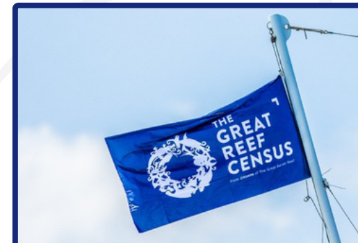
Proudly a CoGBR Founding Partner