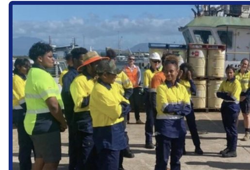
Visiting students from AFL Cape York House